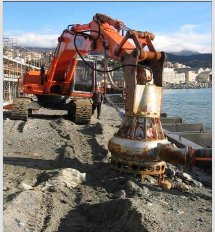
DPH300 Pump Civil works